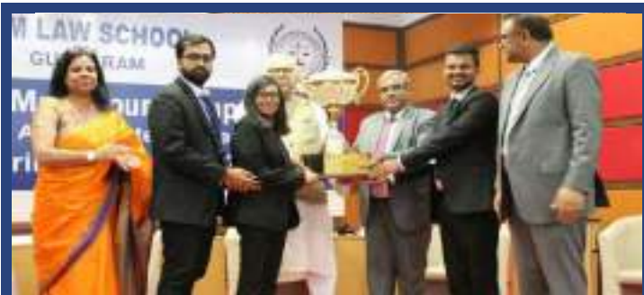
Our Students Runner up at IILM National Moot Court Competition, Gurugram (2022)