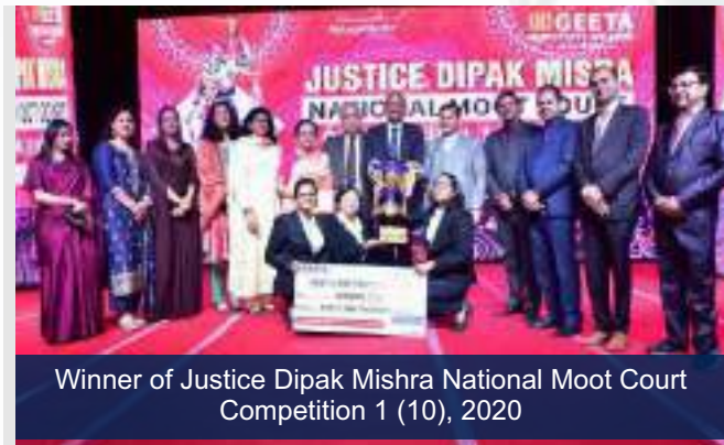
Winner of Justice Dipak Mishra National Moot Court Competition 1 (10), 2020