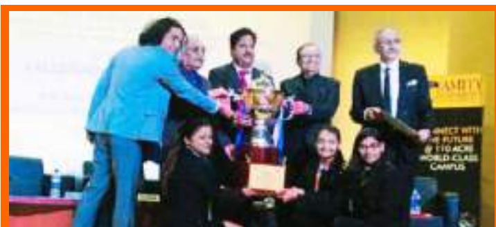
Our Students Winners at Amity University, Gurugram (2019)