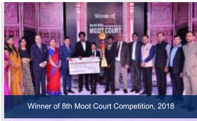
Winner of 8th Moot Court Competition, 2018