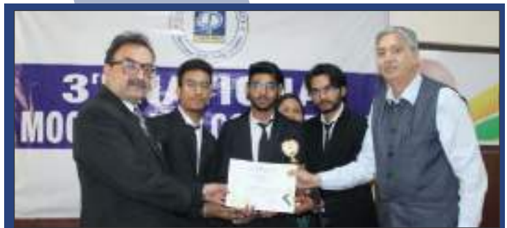
Our Student Semi-Finalists at Career Point University, Hamirpur