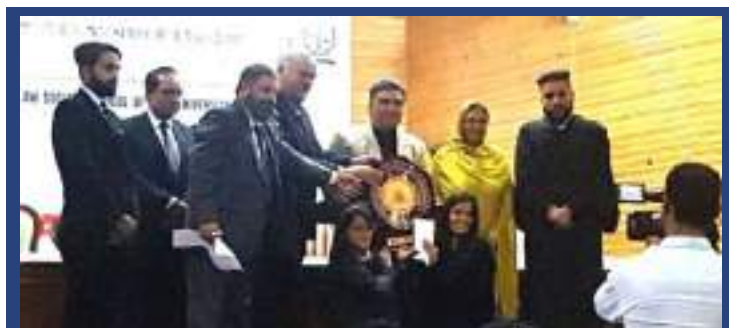
Our Students Winners at University of Kashmir (2018)