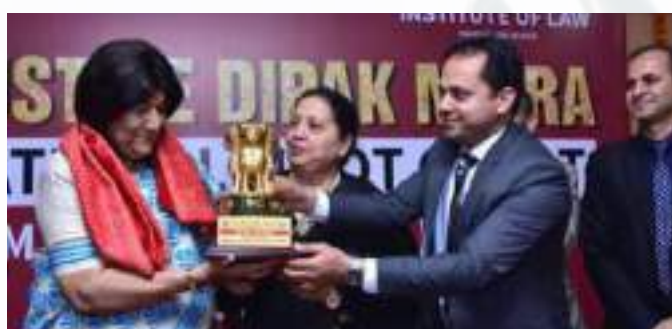
Hon'ble Ms. (J.) Indira Banerjee, Judge Supreme Court of India