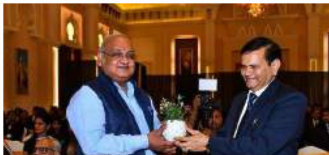
Hon'ble Mr. Justice Dinesh Maheshwari Judge, Supreme Court of India