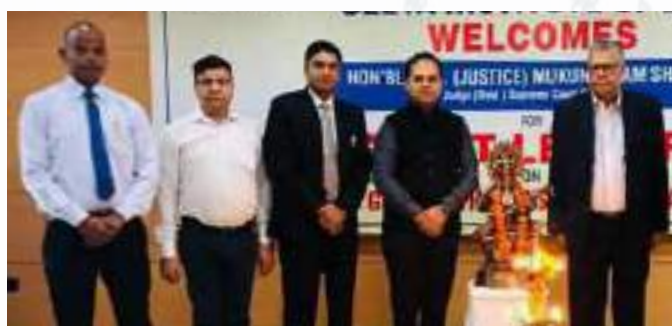
Hon'ble Mr. Justice Mukundakam Sharma, Judge (Retd.) Supreme Court of India