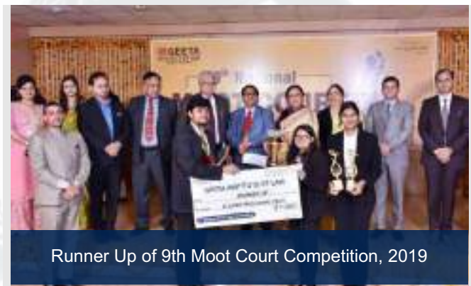
Runner Up of 9th Moot Court Competition, 2019