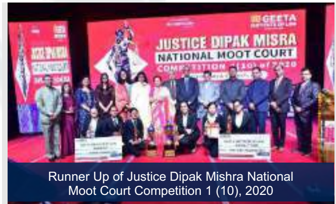
Runner Up of Justice Dipak Mishra National Moot Court Competition 1 (10), 2020