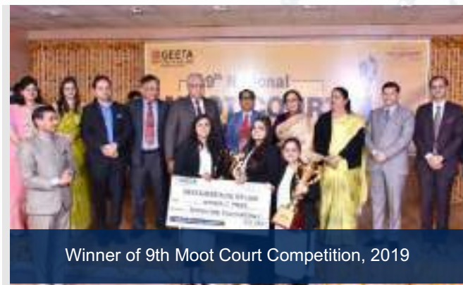
Winner of 9th Moot Court Competition, 2019