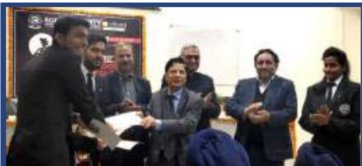
Our Students Winners at SGT University, Gurugram (2019) Receiving Trophy from Hon'ble Mr. Justice Dipak Misra Former CJI