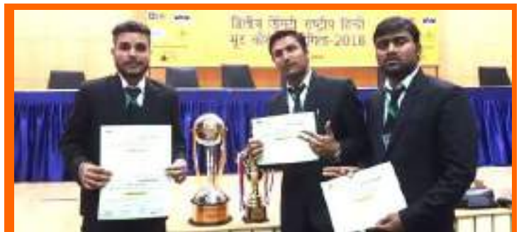
Our Students Winners at Amity University, Noida (2018)