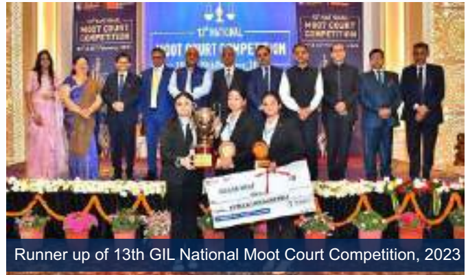
Runner up of 13th GIL National Moot Court Competition, 2023