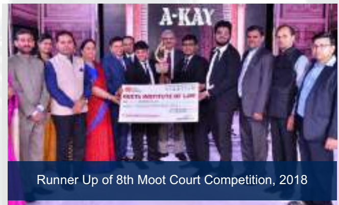
Runner Up of 8th Moot Court Competition, 2018