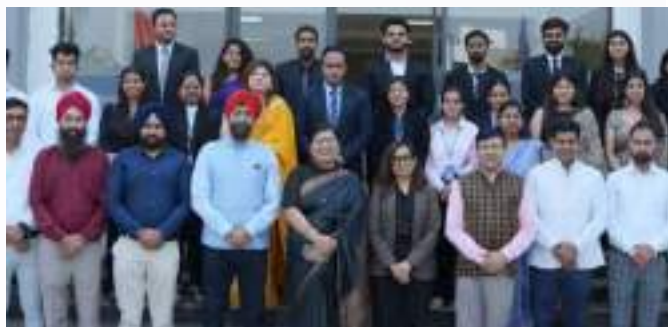
GIL Internship Fair was Organised on Under the Theme "PRASHIKSHAN 4.0"