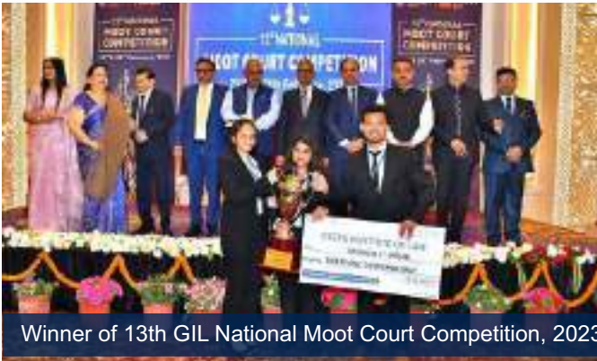
Winner of 13th GIL National Moot Court Competition, 2023