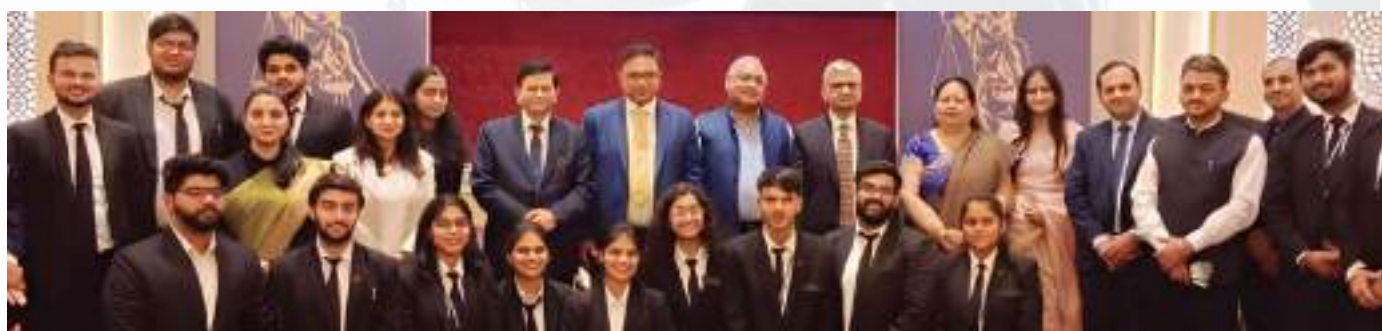
13th GIL National Moot Court Competition, 2023