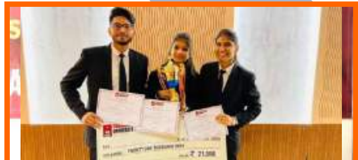
Our Students Runner up at Chandigarh University, Mohali (2019)