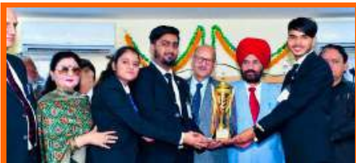
Our Student Semi-Finalists at St. Soldier's Law College, Jalandhar

GIL Moot Court Society very actively organizes workshops for students to train them for National Moot Court Competitions. As a result, Geeta Institute of Law has won Five National Moot Court Competitions at various Colleges and Universities.