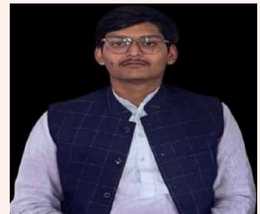
Social work (President) RAC National Awardee