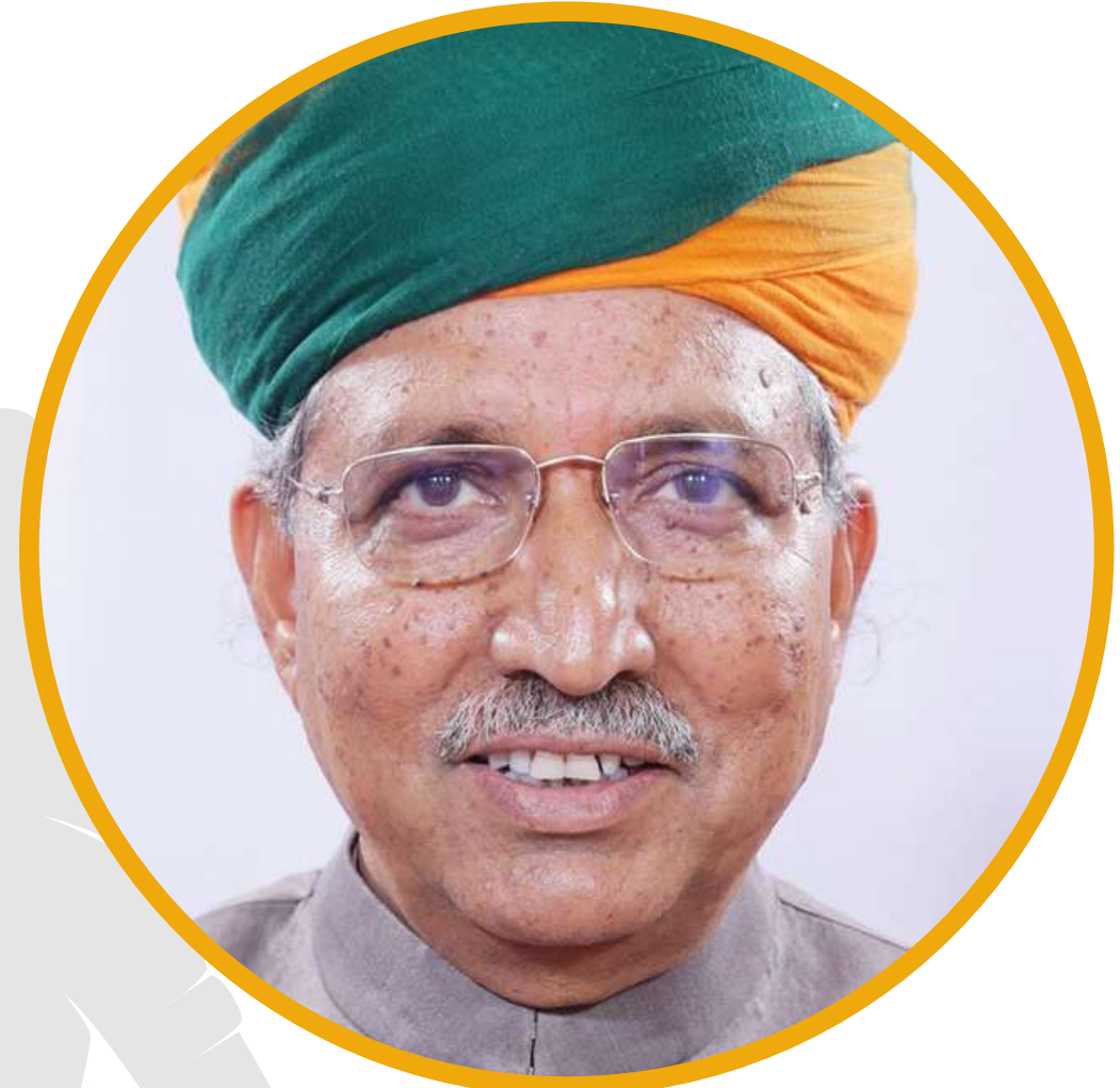
HON'BLE SHRI ARJUN RAM MEGHWAL

HON'BLE GOVERNOR OF HARYANA & CHANCELLOR, DR. B.R. AMBEDKAR NATIONAL LAW UNIVERSITY, SONEPAT