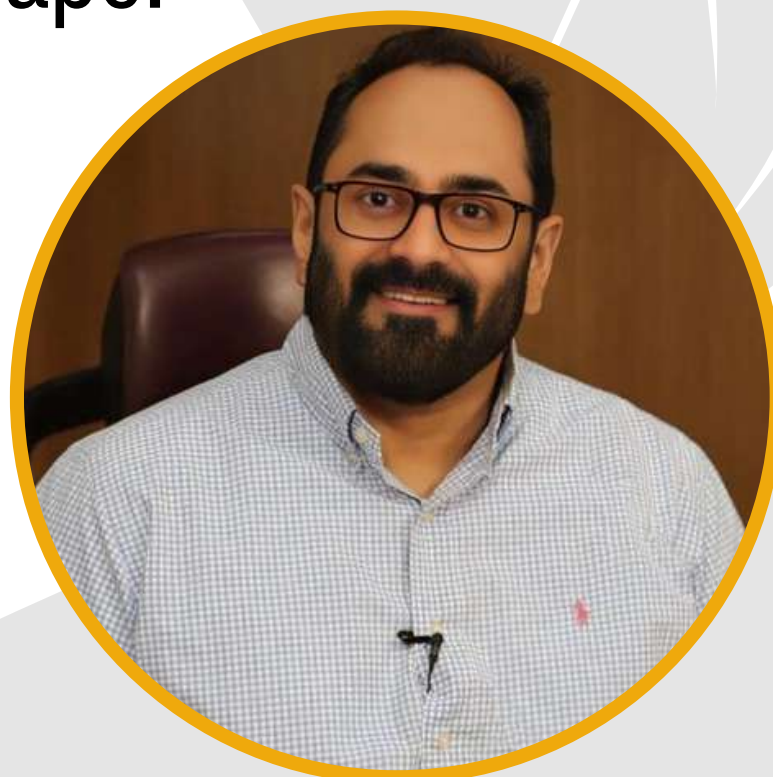
HON'BLE SHRI RAJEEV CHANDRASHEKHAR

Key functions of MeitY include policy formulation related to information technology and electronics, promoting IT education, and overseeing cyber laws. It is instrumental in driving initiatives like Digital India, aimed at bridging the digital divide and enhancing the nation's global role in internet governance. MeitY's vision is centered on leveraging e-development for India's transition into a developed nation and an empowered society. Through its comprehensive approach, MeitY is committed to enhancing efficiency through digital services, promoting inclusive growth, and securing India's position in the global digital landscape.