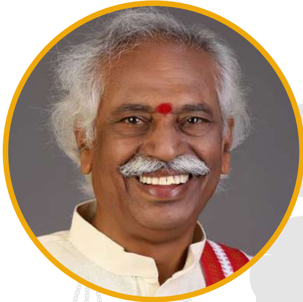
HON'BLE SHRI BANDARU DATTATRAYA

HON'BLE GOVERNOR OF HARYANA & CHANCELLOR, DR. B.R. AMBEDKAR NATIONAL LAW UNIVERSITY, SONEPAT