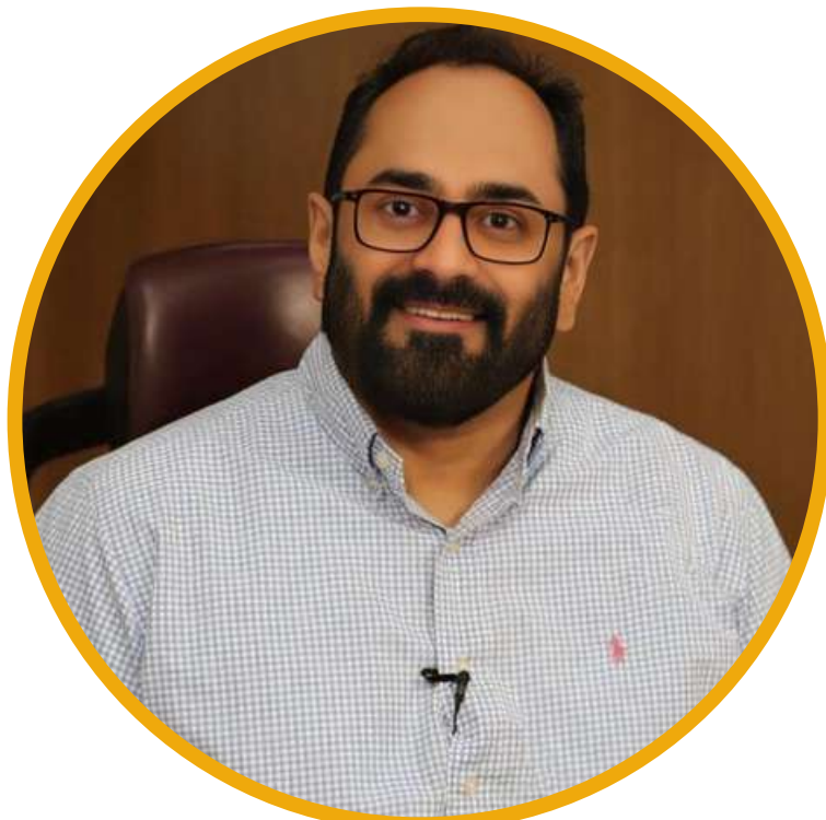
HONBLE SHRI RAJEEV CHANDRASHEKHAR

HON'BLE UNION MINISTER OF STATE (I/C) FOR LAW & JUSTICE, PARLIAMENTARY AFFAIRS AND CULTURE, GOVT. OF INDIA