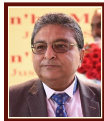
Hon'ble Mr. Justice Vineet Saran Former Judge, Supreme Court of India