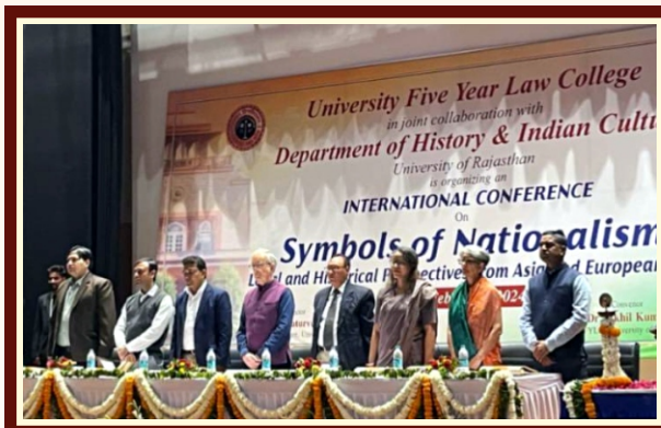
INTERNATIONAL CONFERENCE ON "SYMBOLS OF NATIONALISM"