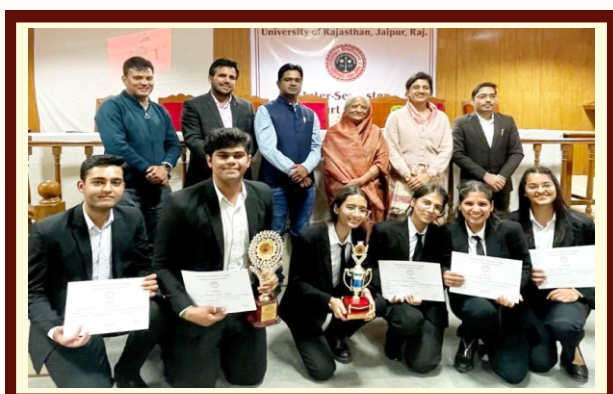
UFYLC ISMCC 2022