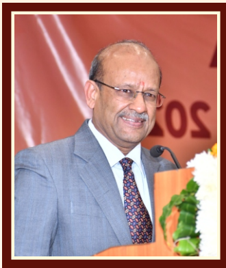
Hon'ble Mr. Justice Rajesh Bindal Supreme Court of India