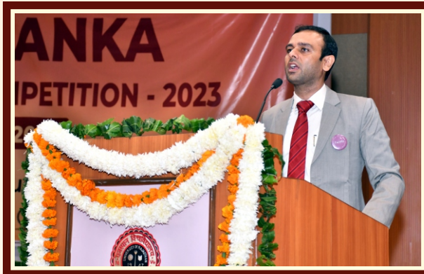
11 th UFYLC RANKA NMCC INAUGURATION