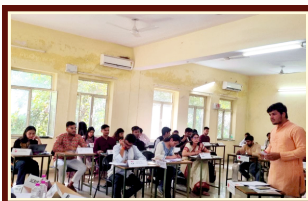
"YOUTH PARLIAMENT SAMVAAD-2023"