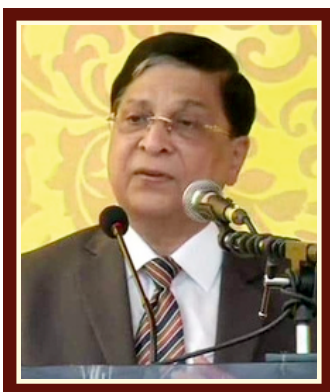
Hon'ble Mr. Justice Dipak Misra Former Chief Justice of India