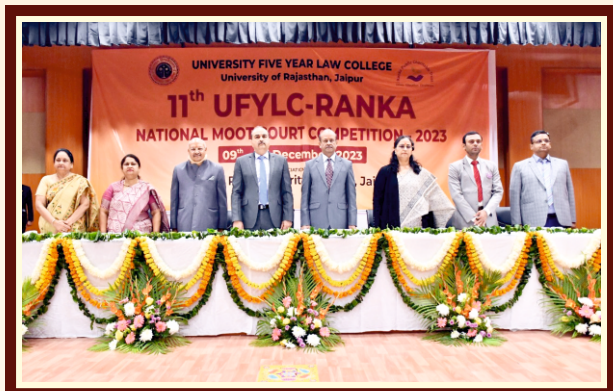
11 th UFYLC RANKA NMCC INAUGURATION