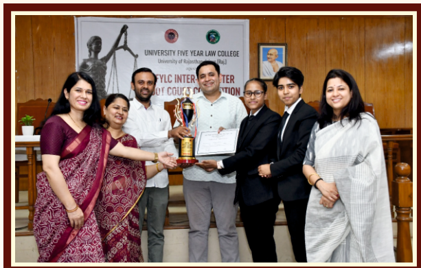
UFYLC ISMCC 2024