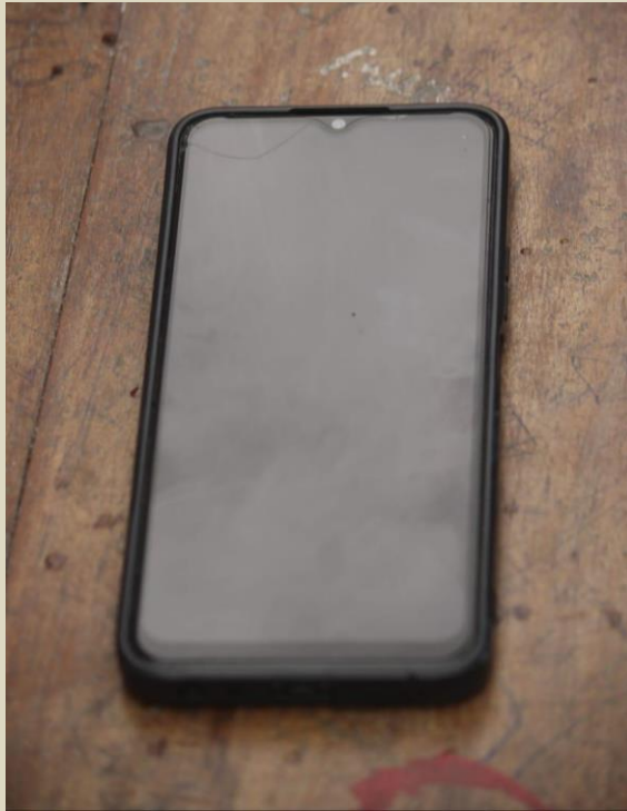
SA 2 - MOBILE PHONE