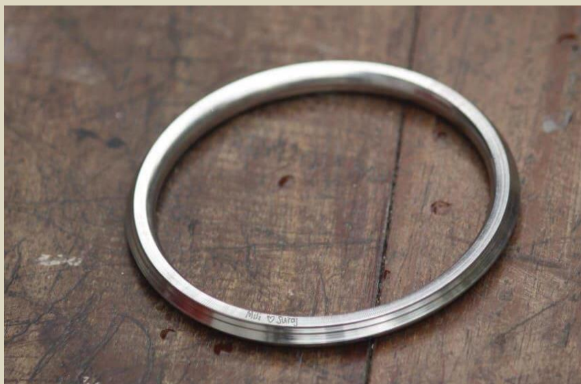
SA 9 - KADA