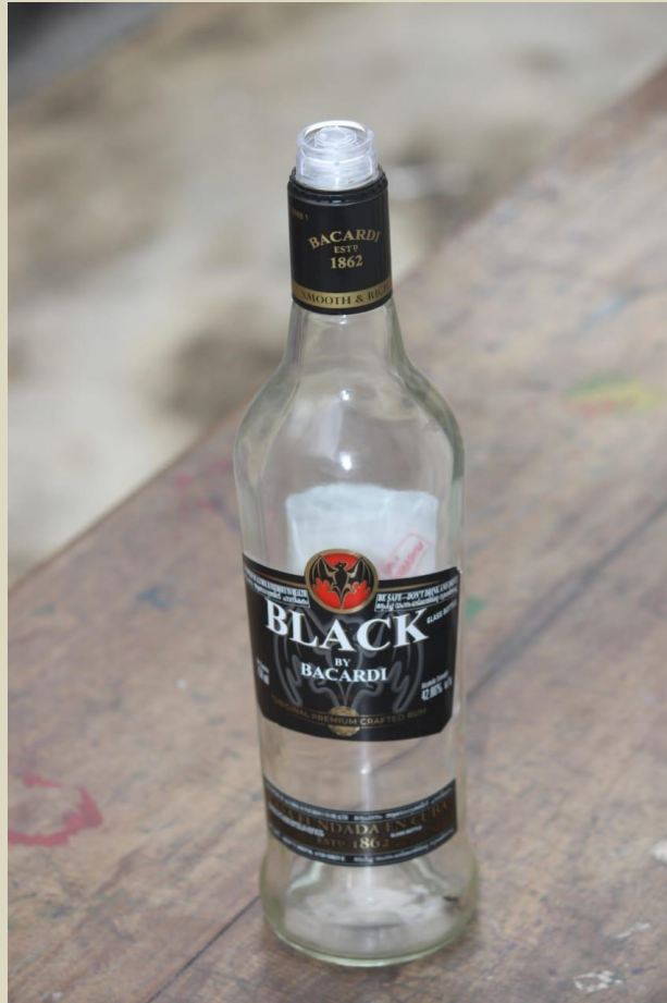
SA 8 - ALCOHOL BOTTLE