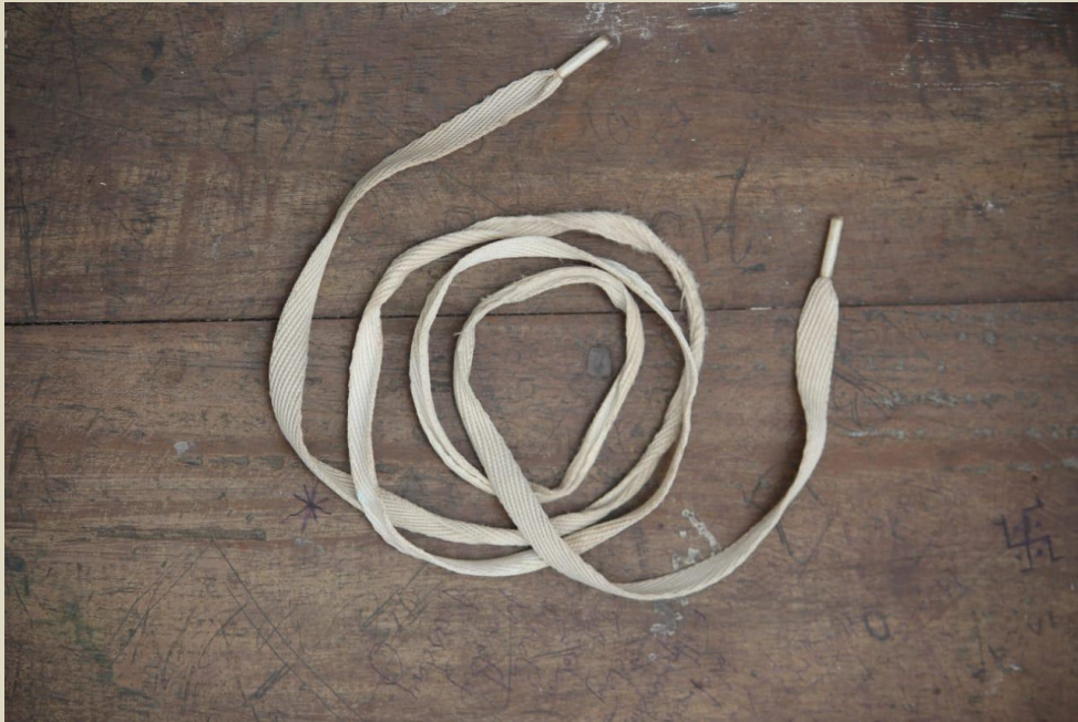
SA 4 - SHOE LACE