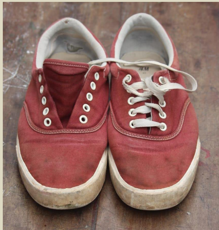
SA 5 - SHOES