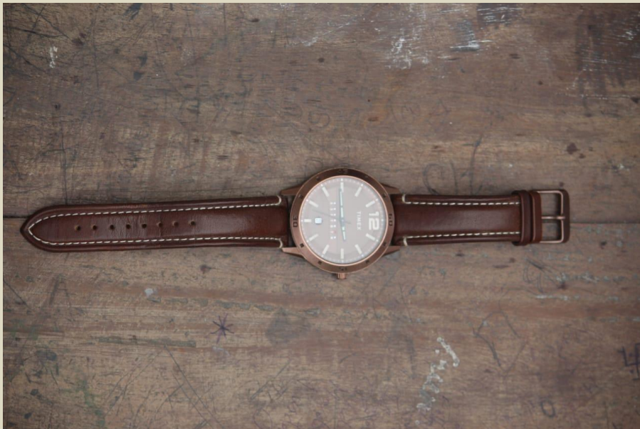
SA 3 - WATCH