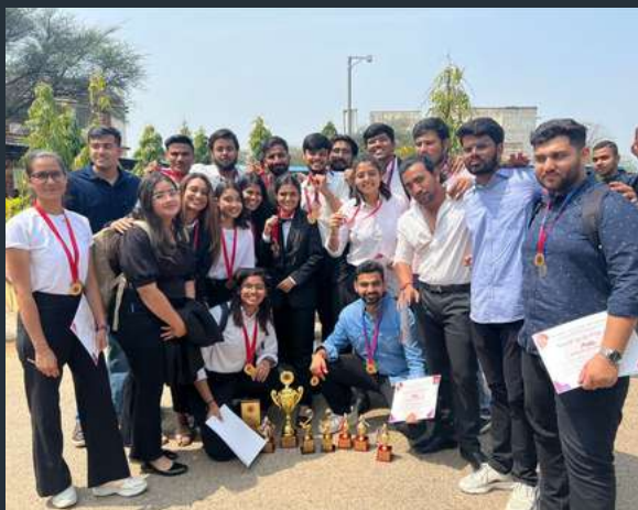
INTRA COLLEGE SPORTS MEET