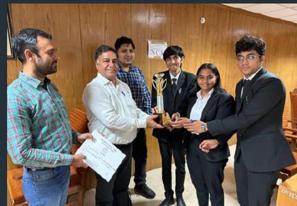
UFYLC ICMCC, 2023