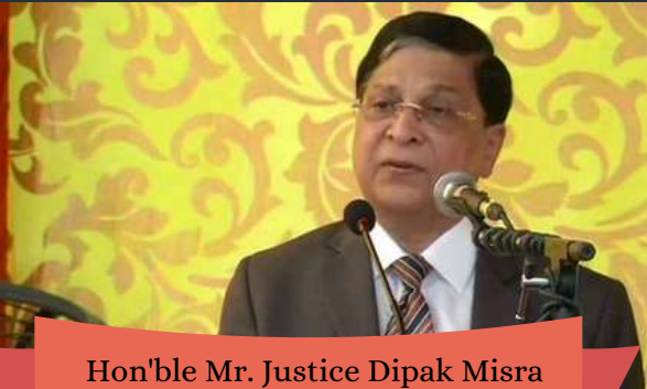
Hon'ble Mr. Justice Dipak Misra Former Chief Justice of India