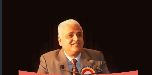
Hon'ble Mr. Justice Anil R. Dave Former Judge of Supreme Court of India