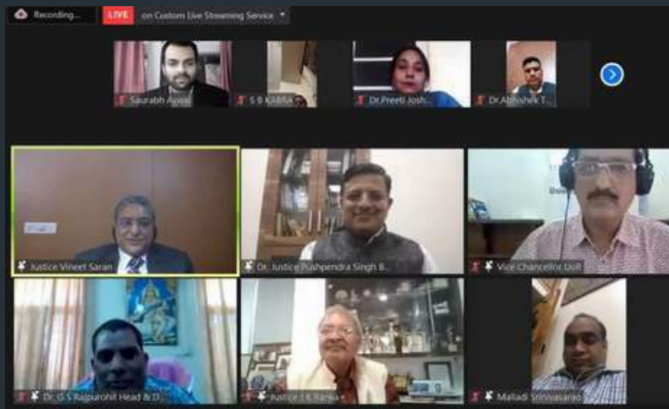
10th FYLC RANKA MOOT COURT- ONLINE