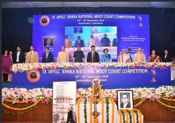
9th FYLC RANKA MOOT COURT