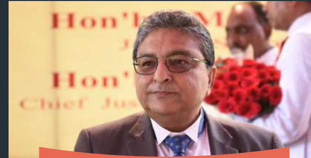
Hon'ble Mr. Justice Vineet Saran Former Judge, Supreme Court of India Chief Guest, 10th Fylc Ranka Moot Court