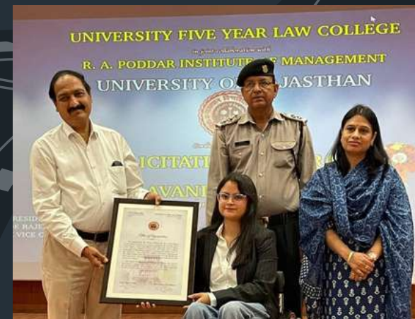
Avani Lekhara FELICITATION PROGRAM