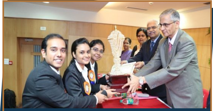
Winners of 3 rd National Level Moot Court Competition