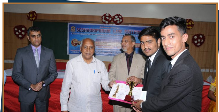
Best Memorial of 4 th National Level Moot Court Competition held on 10 th September 2017