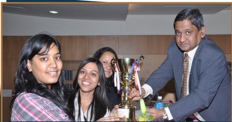
Runners up in 2 nd National Level Moot Court Competition