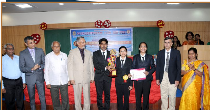
Winners of 4 th National Level Moot Court Competition held on 10 th September 2017