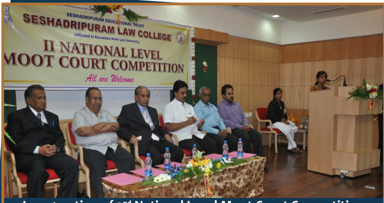
Inauguration of 2 nd National Level Moot Court Competition by Hon'ble Mr. Justice N. Venkatachala Former Judge, Supreme Court of India, Former Lokayuktha, Karnataka