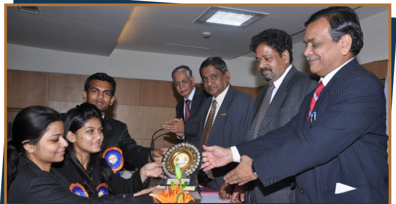
Participating team receiving certificates and mementos from the judges