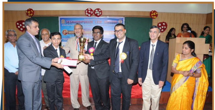
Runners-up of 4 th National Level Moot Court Competition held on 10 th September 2017