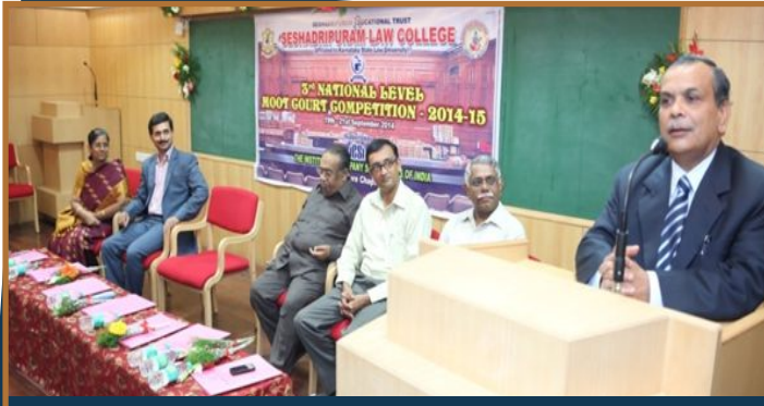
Inauguration of 3 rd National Level Moot Court Competition by Hon'ble Mr. Justice N. Kumar, Former Judge, High Court of Karnataka