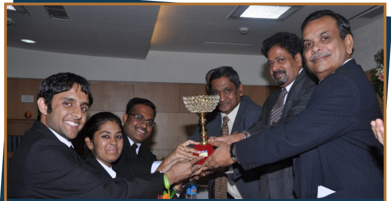
Winners of 2 nd National Level Moot Court Competition