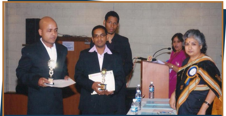
Participating team receiving certificates & mementos from the High Court Judge