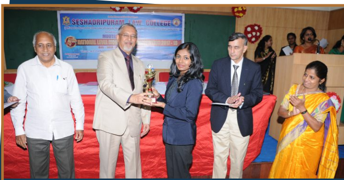
Best Speaker of 4 th National Level Moot Court Competition held on 10 th September 2017